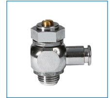
Flow Control Valves - with Swivel joint