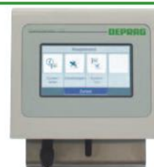
Base station with table stand

The base station ComCenter 10 is used to generate and adjust screwdriving programs and enables documentation of results data via the integrated web server. It has an Ethernet and Bluetooth port and can be optionally equipped with a Fieldbus port. The base station ComCenter 10 has a touch screen display