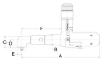
Angle Body Style